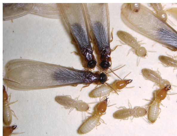
Fig. 1. Coptotermes gestroi , alates (winged), soldiers (orange head capsule) and workers (white head capsule).

Krishna et al. (2013b) listed 110 species names within Coptotermes that conformed to the rules of the International Code of Zoological Nomenclature (ICZN) and, among them, 69 were regarded as valid in the taxonomic literature, and 42 were listed as subjective synonyms. The list also included four objective synonyms and ten nomina nuda (not treated herein). Out of the 69 species listed as valid by Krishna et al. (2013b), about half of the species are known only from limited material (e.g., one caste described, single colony of origin, or a single alate, no comparison with previously described specimen, etc.). Some descriptions are over a century old and may not meet modern rigour. Although molecular taxonomy offers tools to validate species or synonymization, such data have yet to be collected for most species. As a result, the validity of many species names as real biological taxa is uncertain. For example, the unusually high species diversity of described Coptotermes in China (22 species) represents an anomaly that requires close scrutiny (Eggleton, 1999; Wang & Grace, 1999; Li, 2000; Yeap et al. , 2009; Li et al. , 2011). Krishna et al. (2013a) provided an invaluable