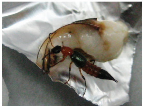
Fig. 1. Adult P. fuscipes . (Online figure in color.)

In the current study, we exposed P. fuscipes to four insecticide products (deltamethrin [Crackdown 10SC; Bayer CropScience, Petaling Jaya, Selangor, Malaysia], imidacloprid [Premise 200SC; Bayer CropScience], fipronil [Termidor 25EC; BASF Agro BV Amhen (NL), Waedenswill, Switzerland], and fenitrothion [Sumithion 20MC; Sumitomo Chemical, Tokyo, Japan]) that are commonly used in professional pest management programs and